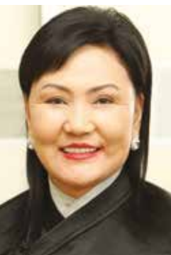
Ms. Dulamsuren OYUNKHOROL Former Minister of Nature Environment and Tourism of Mongolia

Compared to many densely populated countries, Mongolia has vast expanses of pristine land. With the expansion of globalization, conservation of nature is a top concern of both my country and me personally, since many of our ecosystems are both unique and fragile. This is particularly true for the Great Gobi landscapes, large portions of which are strictly protected by Mongolian law. The Dzungarian Gobi ecosystem in the Southwest of Mongolia is spectacular in several ways – not only through scenic beauty but also in that it hosts a great diversity of wildlife, including large herds of Goitered Gazelle, Khulan, and Takhi. The presence of free-roaming takhi in this habitat is especially noteworthy, considering the extreme rarity of this species, which went extinct in the wild some 50 years ago.