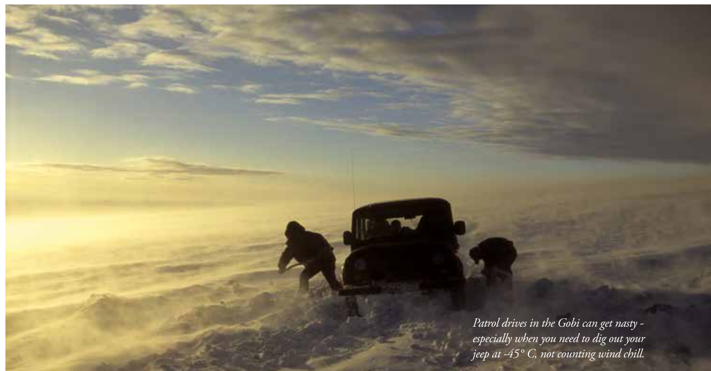
Patrol drives in the Gobi can get nasty - especially when you need to dig out your jeep at -45° C, not counting wind chill.

We humans bear the blame for the extinction of the takhi here. But if we manage them well, I am fairly certain that they will recolonize the Dzungarian Gobi by the thousands.