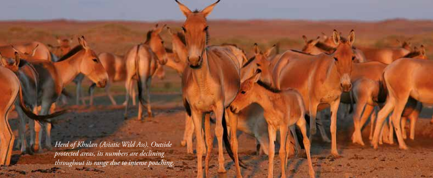
Herd of Khulan (Asiatic Wild Ass). Outside protected areas, its numbers are declining throughout its range due to intense poaching.