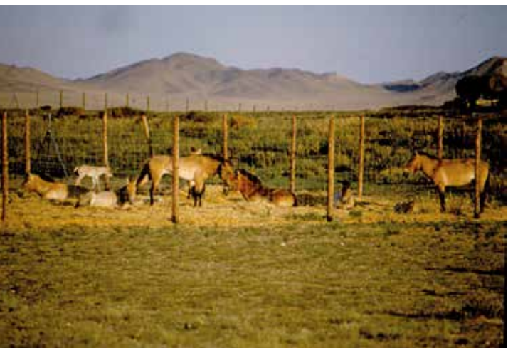
The Pas harem makes itself comfortable in the hay storage