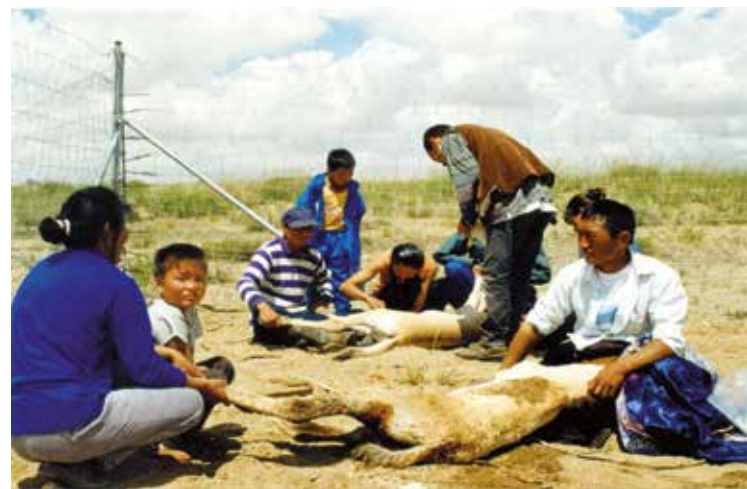
Treating foals with wolf bites