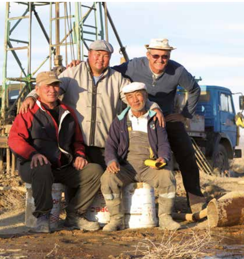
The new well in Takhin Tal provides fresh water for the ranger camp.

Transporting takhi to Mongolia is costly. In 2011 you established a successful cooperation with the Czech Airforce, which has since been flying takhi to the town of Bulgan at mere operation cost. How did you achieve it?