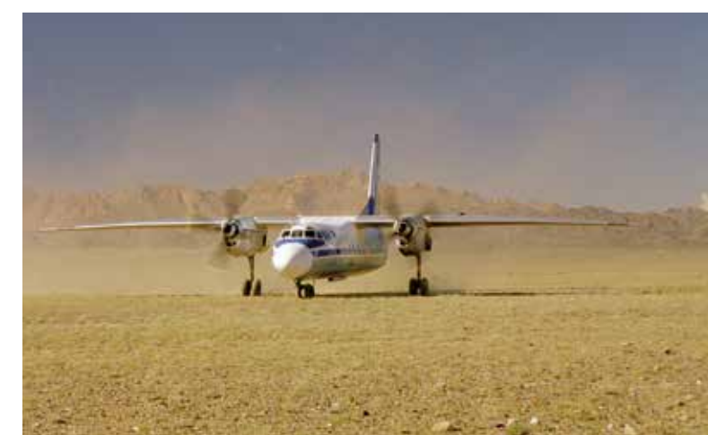
In the pioneering days of the reintroduction programme, the takhi - up to 14 in a single load - were transported aboard a Swissair passenger plane. In Beijing, the crates with the takhi were loaded onto a small plane from which all seats had been removed. This machine was able to land on a gravel plain in the national park, right next to the acclimatization enclosures.